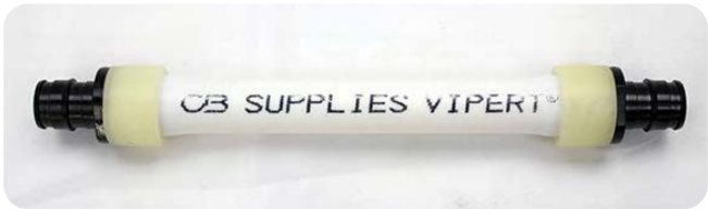
CUT LENGTH OF PIPE