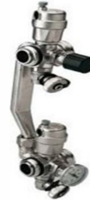
Differential Pressure Bypass Assembly