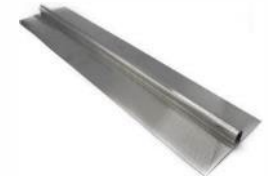
Heat Transfer Plate