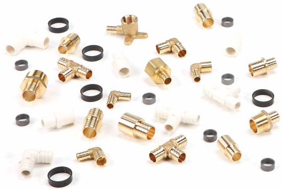
ABOVE: BRASS AND POLY-ALLOY INSERT FITTINGS SHOWN WITH COPPER CRIMP RINGS

CANPEX UV Plus production began in November 2010 and is in stock at our warehouses. CANPEX UV Plus comes with a system-wide 25-year limited warranty.